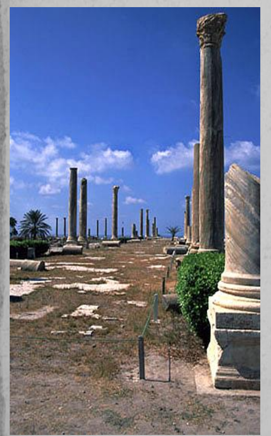
Colonnaded Street, Roman Tyre