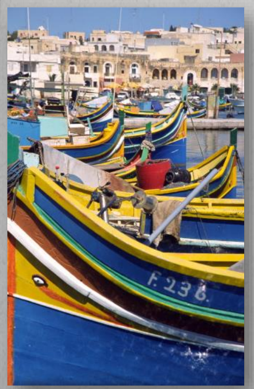
Colourful 'Luzzu' fishing boats, Valetta harbour

Cost £1295.00 per person in twin room (excl. international flight) Single supplement £395.00