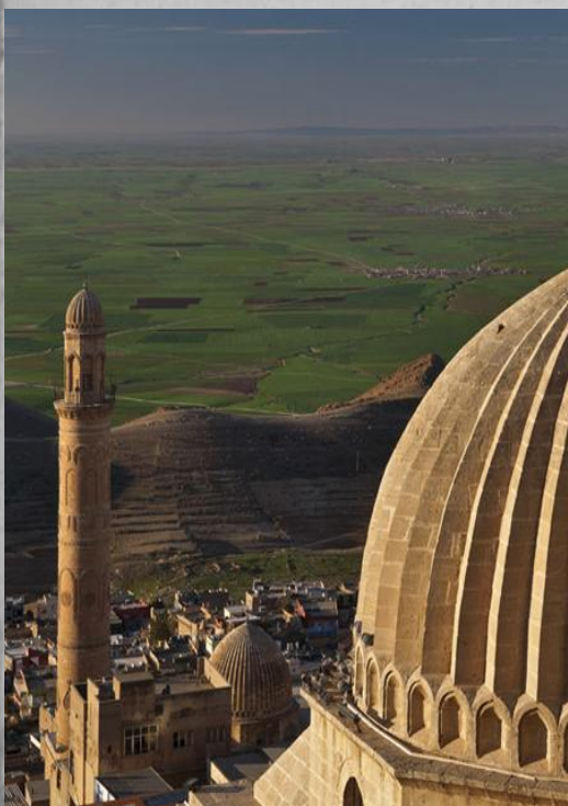
Fascinating limestone architecture, Mardin